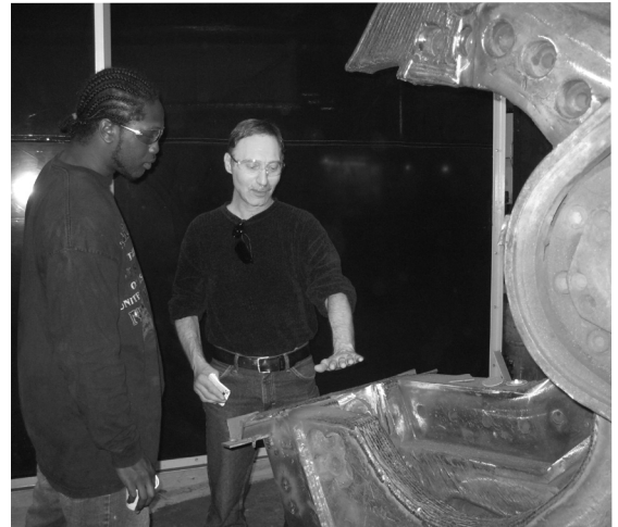
Career Exploration participants feel the heat from a recent weld on a mobile shear at Genesis Attachments.

"I loved the tours and seeing what is actually done in that work place—a firsthand being-there-at-the-factory experience."